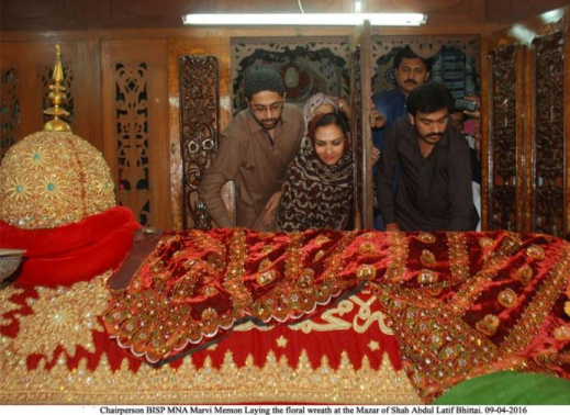
Chairperson BISP MNA Mervin Memon Laying the floral wreath at the Mazar of Shah Abdul Latif Bhittai. 09-04-2016

(Published in Express, Naibaat, Jinnah and Ausaf)